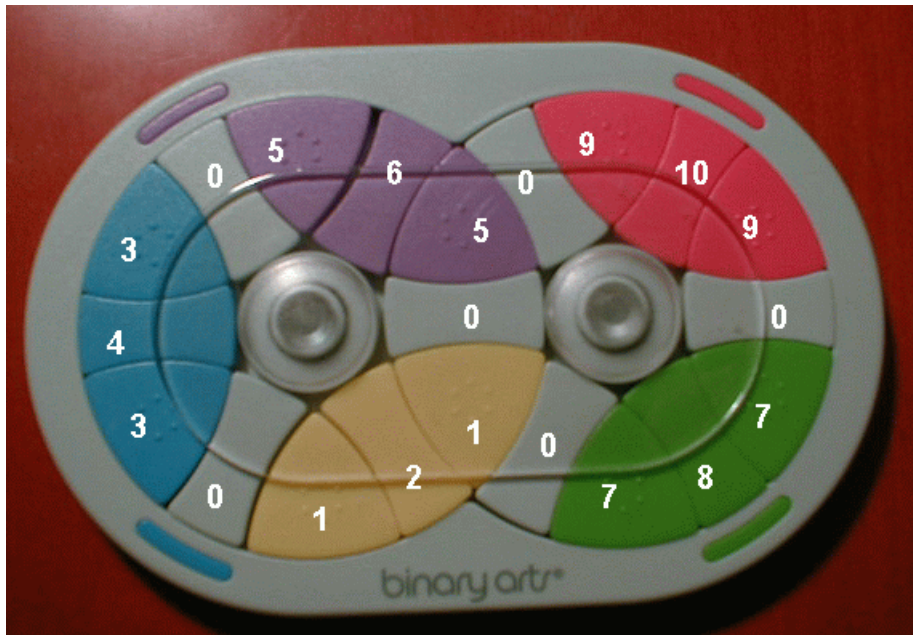
Figure 2. The puzzle after rotating the left wheel on step clockwise from the final configuration.

2 1 0 3 4 3 0 5 6 5 0 1 0 7 8 7 0 9 10 9 0 5 0 1